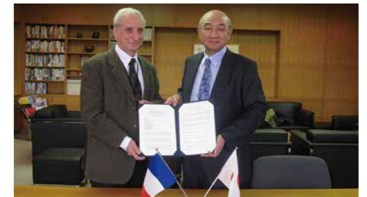
Signing ceremony for agreement with the Population and Development Research Center, Paris Descartes University, France