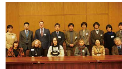
International workshop based on agreement with the Russian Museum of Ethnography