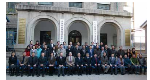
International symposium based on agreement with the Institute of Ethnology and Anthropology, Chinese Academy of Social Sciences