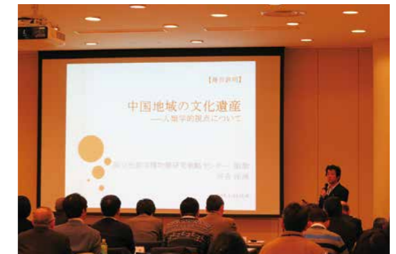
International Forum “Cultural Heritage in the Regions of China: Anthropological Perspectives”