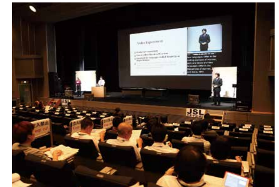
International Symposium “Language Documentation and Cross-modal Typology”