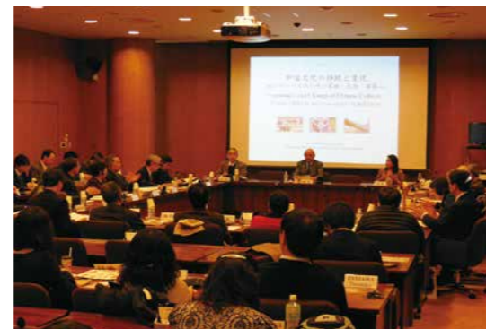
International Symposium “Continuity and Change of Chinese Culture: Family, Ethnicity and State under Globalization”