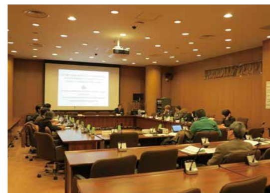
International Workshop “Collaboration with Source Communities in the Exhibition of Collections and Media in Ethnological Museums”