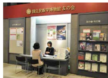
Minpaku Associates Desk

With 130 seats (110 inside the restaurant and 20 on the terrace) available, our restaurant accepts reservations from groups of various sizes: from a few individuals to parties of a larger number of people. Group customers can also reserve our box lunches.