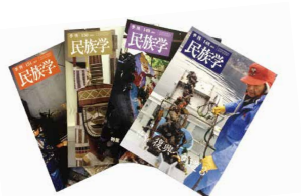
Kikan Minzokugaku [Ethnological Quarterly]