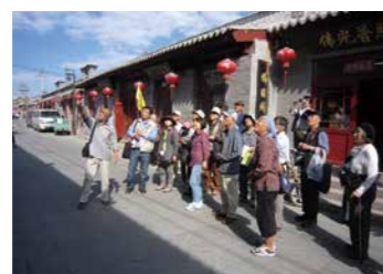
"Ethnological Study Tours Overseas" organized by Minpaku Associates ( Minpaku Tomonokai )