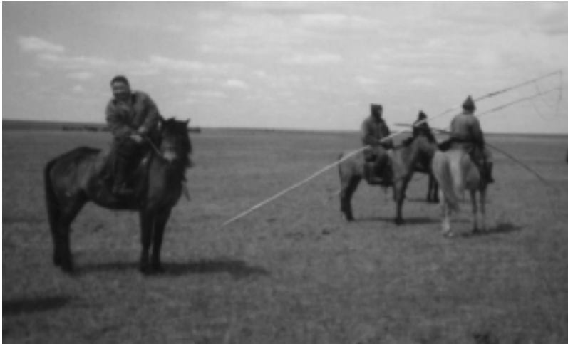
Buryat celebration of Malai Emnee, a seasonal holiday associated with cattle breeding. Shenekhen, Inner Mongolia, 1998.

little contact with their motherland (especially after the mid-1930s), because Soviet authorities stigmatized representatives of this group as 'national enemies', 'counter-revolutionary', 'pan-Mongolists', and in other ways, and prohibited any contact with them. There is no doubt that this policy also influenced scientific discourse of that time. As a result, at the beginning of 'perestroika' in the mid-1980s, very few Buryats in Russia knew of the Shenekhen Buryats living in Inner Mongolia, and named after the river and region of Shenekheen).