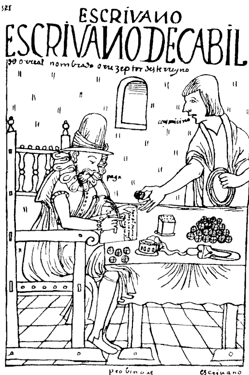
Illustration from Felipe Guaman Poma de Ayala Nueva [1621] Cronica y buen gobierno

Religion was also crucial for bringing the Indios into the regime. Christianity was based on a book, the Bible, and without the spread of literacy among the Indios , even this canonical