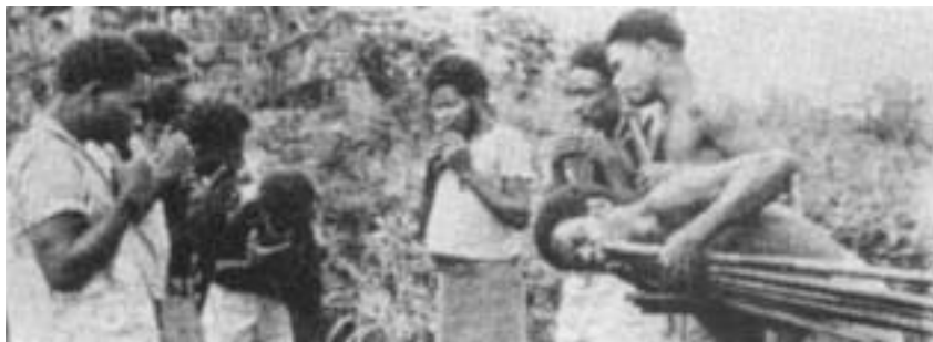
Fig. 4 A pan pipe ensemble from the Solomon Islands.