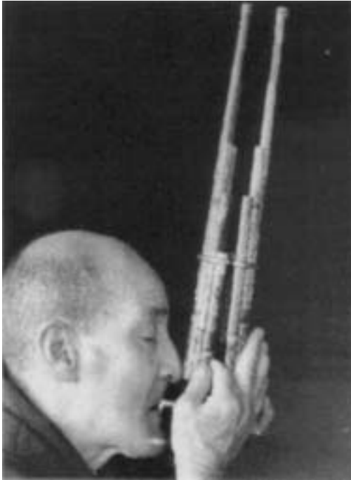
Fig. 2 The free reed as a bundle of pipes: the sho of Japan.