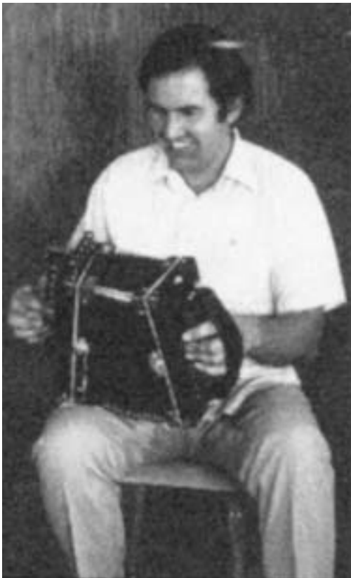
Fig. 3 An American Cajun musician with a button accordion.

sound playing quietly at specific locations. It should be quiet enough to not disturb those not listening to it, yet still clear enough to be heard. This method is now used very successfully at Minpaku. One very good method for including the sound of music is used at the new Experience Music Project in Seattle Washington. The music is beamed down from above directly to the individuals standing below and is virtually unheard by anyone else standing nearby.