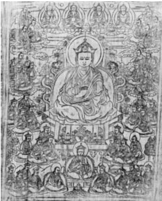
A figure representing the Bonpo master Kundrol Dakpa (b.1700), one of the wood block prints kept in National Museum of Ethnology