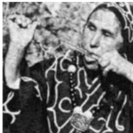
Fig. 1 The Ainu mouth harp, mukukuri. (old archive photo)

The author is an ethnomusicologist who has done field work in Japan, Burma, Romania, Turkey, Mexico and Central America, Zimbabwe and elsewhere. He founded the ethnomusicology program at the University of Washington and has created hundreds of ethnographic documentary films of music and dance performances, the largest number being films made in the Philippines and Korea during 1965 and 1966. While at Minpaku, he has completed a book 'Music: the Cultural Context' Senri Ethnological Reports 47 (2004 press). Most recently, he has been concerned with the use of computer technology for the presentation, preservation and documentation of research material in ethnomusicology.