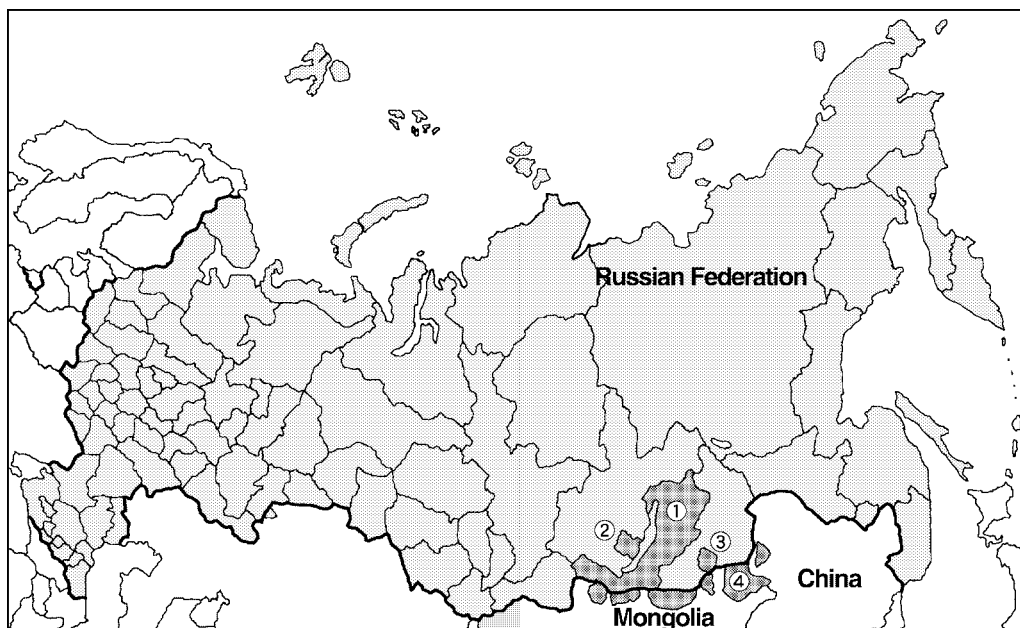
① Republic of Buryatia ② Ust-Orda Buryat autonomous region ③ Aginsk Buryat autonomous region ④ region of Shenekheen

The author is a senior lecturer in the Department of Culture Studies at Buryat State University (Russia). She received her Ph.D. in cultural anthropology at the Institute of Mongolian Buddhism and Tibetan Studies within the Siberian Branch of the Russian Academy of Sciences. In 2001 she was a visiting researcher at Tohoku University, with support from the Obuchi Fellowship Program. She has published a book and more than 20 articles on Mongolian traditional culture and the Buryat diaspora.