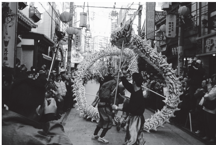
Dragon dance, lion dance and other ethnic Chinese arts shown during festivals are helping to revitalize the town (Chen, 2005)

After the 1980s, a 'gourmet boom' accompanied the bubble economy in Japan. Popular media such as travel journals and television often covered the food in Yokohama Chinatown. As the image of a 'theme park of Chinese cuisine' strengthened, more and more Japanese-owned shops changed their business and started to come out with Chinese-style marketing. For example,