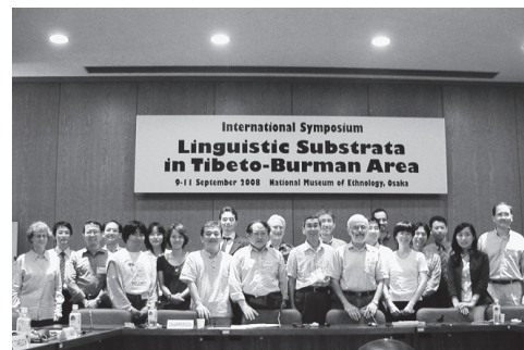
Linguistic Substrata in Tibeto-Burman Area

This project marks the third phase of 'Foundational Research into Tibetan Bon Culture' launched at Minpaku in 1995, and represents a summation of