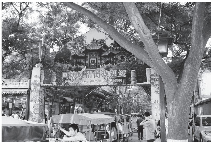
The Paifang on Beiyuanmen Street (Imanaka, 2008)

Gillette, an anthropologist, noted that the Muslim district was not a zone officially recognized by the government (Gillette 2002: 29). However, after the Gates were built, the Muslim district became a visible landmark, and following designation of the Beiyuanmen Muslim Cultural Street, the government actively brought Hui culture into play as a tourism resource. This is a radical change in the history of the Muslim district.