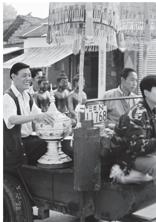
Dai people bringing seated figures of Buddha into the festival ground at Mangshi, Dehong Prefecture, Yunnan. The water-splashing festival still has religious meaning, especially for senior generations (Nagatani, 1998)

From about the year 2000, Dehong Prefecture has used the word 'Mengbalaxi' to represent the Dehong area and established a Mengbalaxi Festival. This is similar to the water-splashing festival, but includes a variety of ethnic events organized by other ethnic groups, such as the Achang, Lisu, Jingpo, and De'ang who reside with the Dai in Dehong Prefecture. The festival has been held almost every year since 2000, during holidays in May, two weeks after the