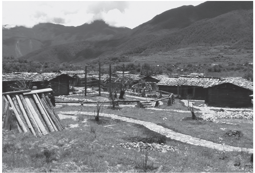
Field museum under construction in Bberdder, which will officially open in 2009. Traditional houses were transported here from Naxi villages and reassembled (Oka, 2007)

While working as an anthropologist in Bberdder, I have faced the need to change my approach from that of 'anthropology about tourism' to 'anthropology involved in tourism'. Other anthropologists might respond differently in a similar situation. I was contacted by villagers representing each of the four positions described above, and was asked to give advice about tourism development. I had to learn how the goals of the villagers connected with the localization of tourism