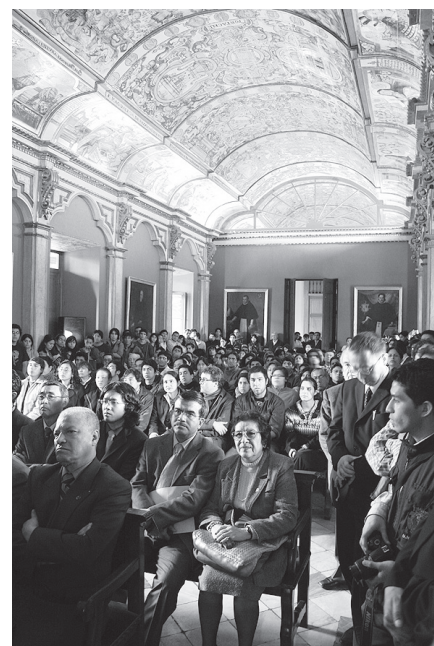
50th Anniversary of the Japanese Expedition to the Andes, Casona Cultural Center