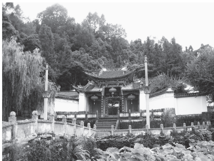
The Ancestor Hall of the Liu Lineage is now a tourist destination (Han, 2008)

Since 1978, China has been gradually transformed according to a new economic model, the socialist market system, and has been increasingly involved in globalization. After changes in central government policies, the primary role of tourism in China was no longer to strengthen international relations and to support ideological propaganda. It became a strategic economic industry. A remarkable feature of recent tourism development in China is the way that native cultures and their localities have been revalued, reconstructed and represented. This localization of culture is new in China.