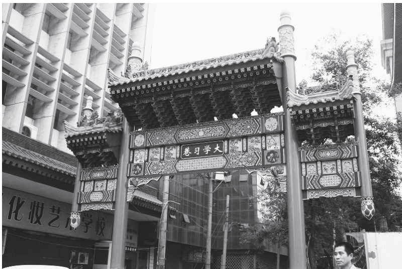
The Pailang on Dxuexixiang Street (Imanaka, 2008)

However, there is no Tang Dynasty architecture in the old urban district targeted by the Huangcheng Revival