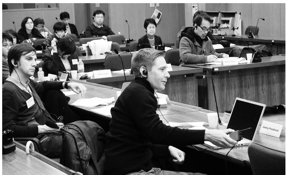
Absorbed in discussion during the international workshop 'Consuming Textiles through their Uses and Reuses'