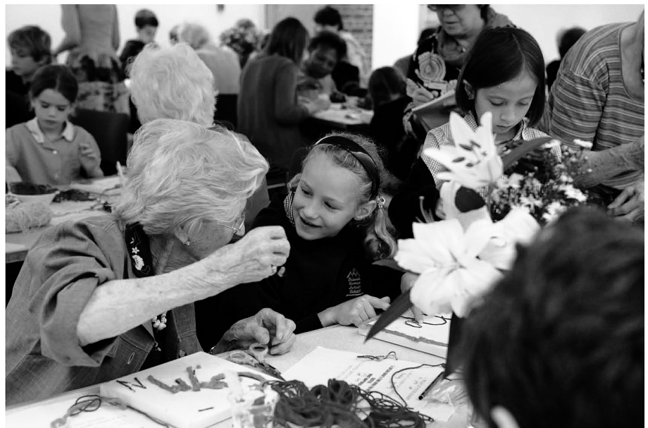
Intergenerational programmes in Dulwich Picture Gallery

The symposium attracted participation by 120 people, including members of the public. In our discussion, we concluded that activities to enhance the well-being of senior citizens may also help