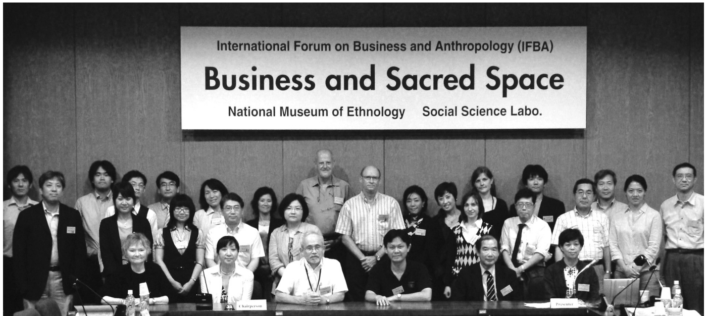
The first International Forum on Business and Anthropology (IFBA) in July 2010 at Minpaku