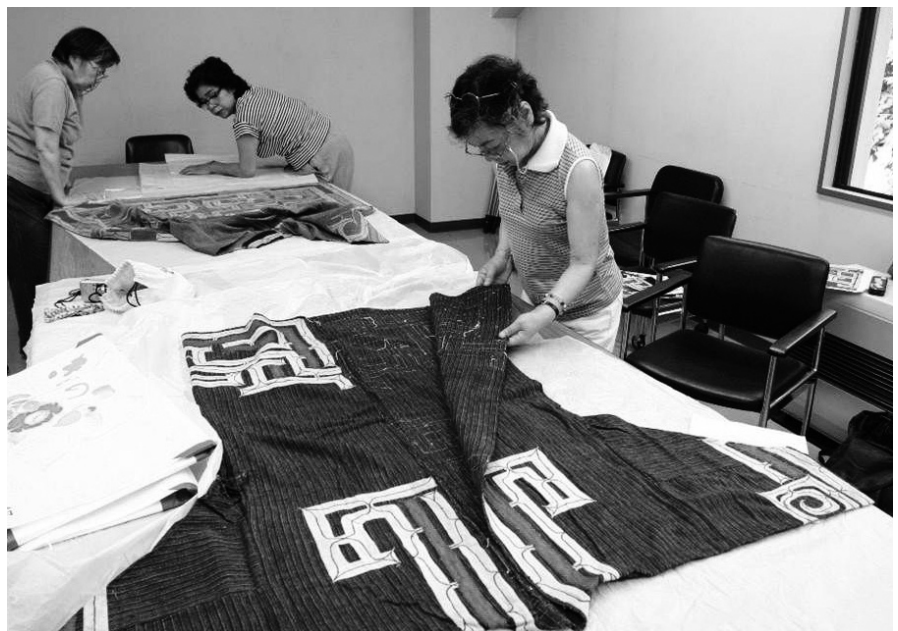
Surveying the old Aynu garments for reproduction (Koji Yamasaki, 2008)

Concerning museums, two researchers described reconstruction of materials for which information is missing and the recovery of orphan works. The importance of adequate administration of materials and collaborative work with source communities