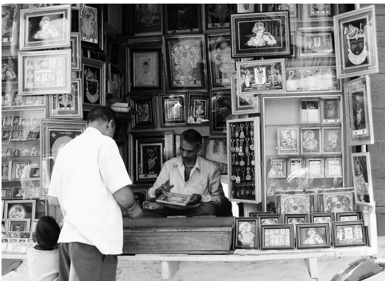
A popular gods' 'photographs' shop in Delhi, India

This symposium focused on the Oyirad, a Mongol group that is still poorly understood and sparsely represented in the scientific literature, although, in recent years, there have been a number of scholarly