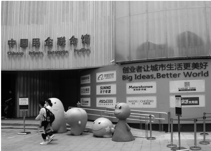
Chinese Private Enterprise Pavilion (CPEP) at the Shanghai Expo in 2010