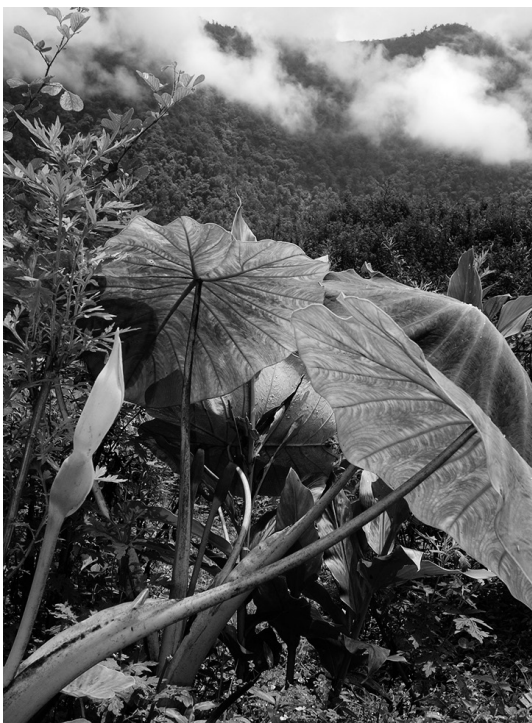
Colocasia yunnanensis, a cold-tolerant wild relative of taro (sato-imo) growing at 2000 m asl near Sapa, in northern Vietnam