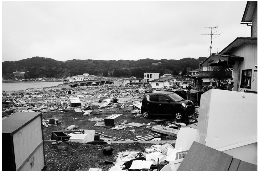
Aftermath of the tsunami in Kirikiri village (Takezawa, 2011)

The next section would demonstrate the subversive power of the tsunami through photos, panels and video. This section would also be filled with daily-life objects destroyed by the tsunami, for example: dishes, cupboards, water pipes, bicycles, motorbikes and