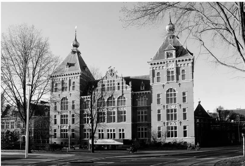
Front side of the Tropenmuseum Amsterdam, 2013

A comparable disaster struck the Tropenmuseum, but here the threat came out of the blue. Due to the economic crisis, the government announced two years ago that it intended to stop financing the museum completely as of January 2013. This led to disbelief, protests and political action. In June 2013 the final verdict was given. The museum budget and the museum staff will be cut in half. This is taking place as I write these lines. The theatre is already closed as well as the library. Furthermore, the Tropenmuseum is obliged to fuse with the National Museum of Ethnology and the Africa Museum into one National Museum of World Cultures. This is expected to take place in January 2014. The objective is to maintain the public functions in all three localities, but there are no guarantees for that. All of these changes seem to signal the end of an era. The future will show us what grows in the new era.