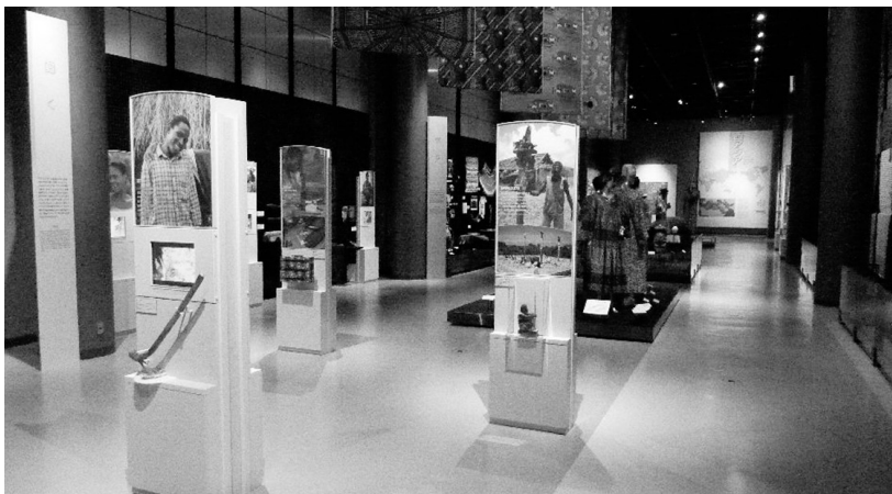
The new African exhibition in Minpaku (Yoshida, 2013)

Another symposium 'Can Art and Museums Contribute to the Renaissance of the Society?' was held on May 26, 2012. This was concerned with a unique challenge now faced in Mozambique, where civil war directly followed the nation's battle for independence from Portuguese colonial rule (1962–1975). The civil war ended in 1992, but a vast number of weapons remained in the country, buried in the bush or hidden in peoples' homes. Now a project called