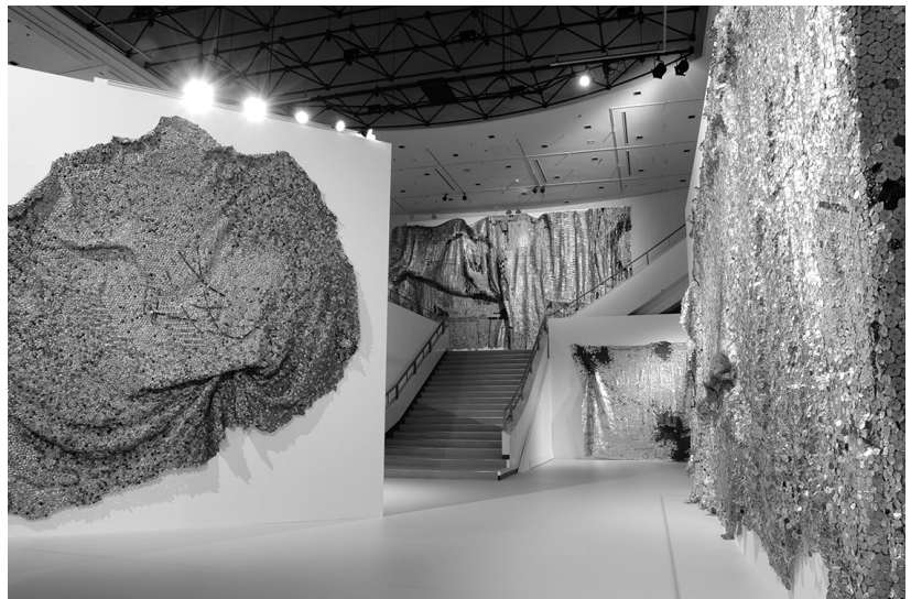
An overview of the gallery with metal-cap installations (2010)