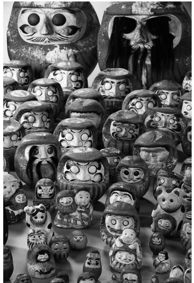
Various Dharmas collected by attic museum members from all over Japan in the first half of the 20th century

Keizo has been called the 'organizer of scholarship' and the 'father of Japanese ethnology' for his many academic contributions including the vast sums of his own money that he spent