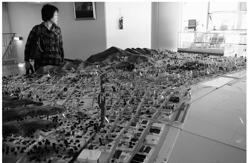
Scale model of the village before the tsunami made for the future exposition (Takezawa, 2013)

instruments of music. After this visitors could watch stories of the people who experienced the catastrophe. The speakers on screen would explain how they personally escaped the tsunami by a hairsbreadth, and how they survived the total razing of their community by it.