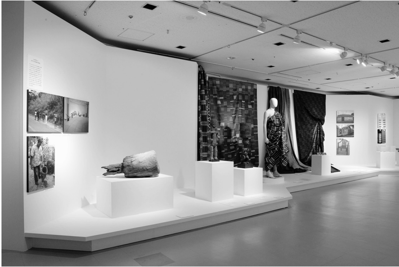
Showing the historical and cultural background through traditional textiles and other objects (2010)

that this explanation cannot satisfy art-world professionals in Africa, who keenly want these works treated just as artwork, and who wonder why only black African artists are discussed in the context of both art galleries and ethnological museums. To deal with this question squarely, it would be necessary for all museums, whether they deal with ethnology or with art, to represent modern and contemporary artists of Europe, America, and Japan in the context of their time, history, and